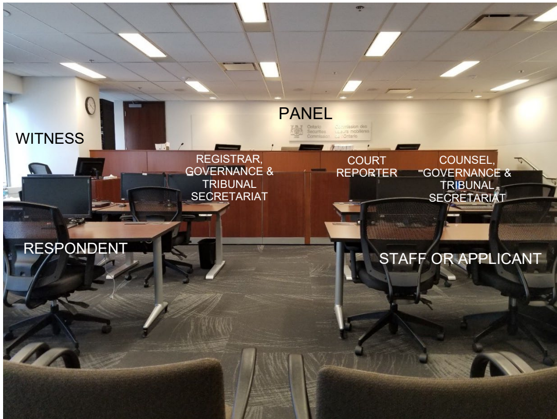
Hearing Room B

The hearing rooms vary in size but are similar to the picture below (which was taken in Hearing Room B). The number of tables, size of public seating, and the location of the witness vary depending on the hearing room.